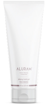
strong hold gel 8 fl oz (237 ml)