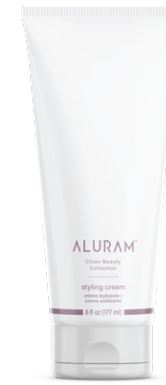
styling cream 6 fl oz (177 ml)