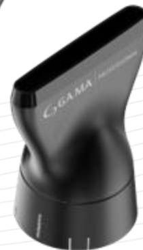
Narrow Nozzle 63.5x8 (mm)