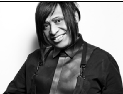
MISAEAL APONTE @MISAEALAPONTEART